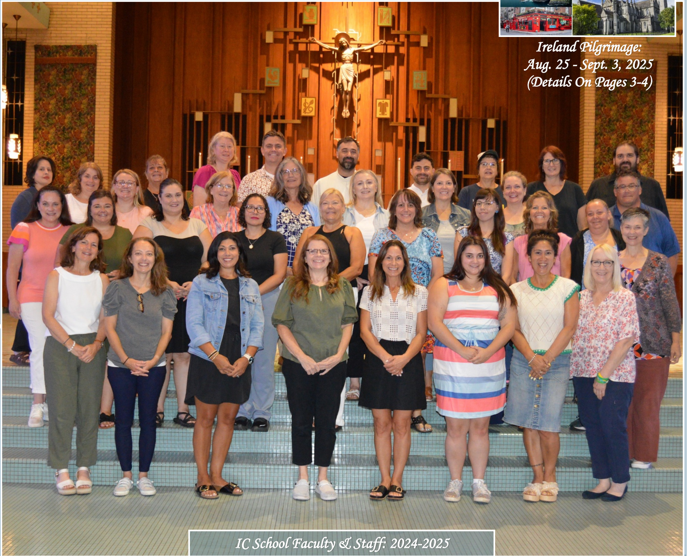
IC School Faculty & Staff: 2024-2025

Welcome Back Teachers, Students & Families!