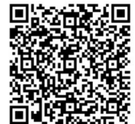
Troop Cookie Site QR Code

Girl Scout Cookies will be available for sale at all our Masses next weekend, February 15 th & 16 th . Boxes of cookies are $6.00 each. If you are unable to purchase in person, please scan the QR Code provided to purchase online. If you live within 5 minutes of IC, we can arrange for pick up or delivery by selecting Girl Scout Troop 20357 delivery on the website. Thank you for supporting our IC Girl Scouts!