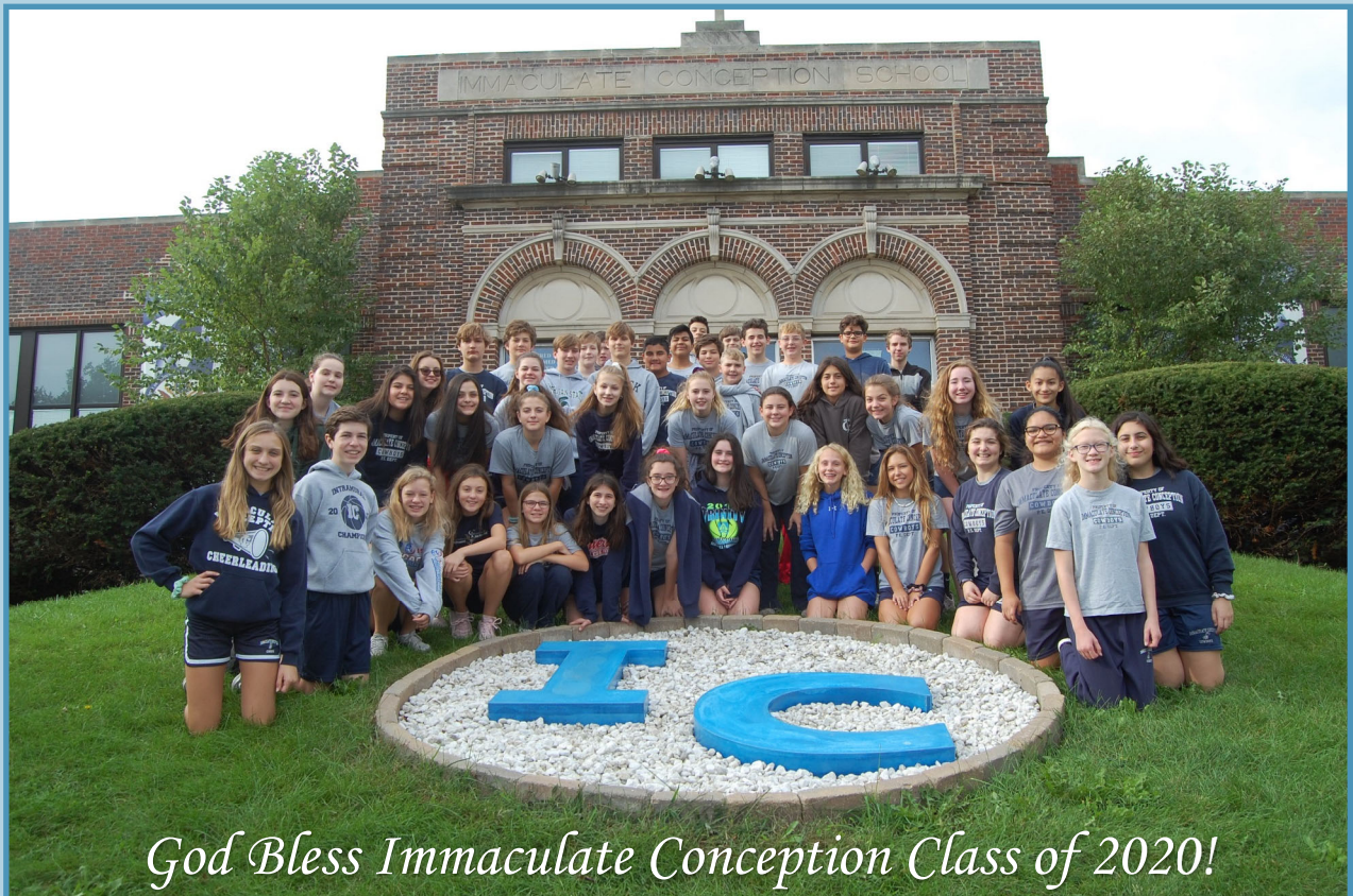
God Bless Immaculate Conception Class of 2020!