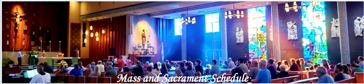
Mass and Sacrament Schedule